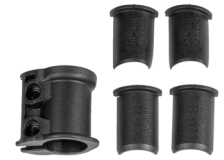
Adapter clamp for dropper seat posts