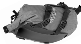
Product can be compressed significantly