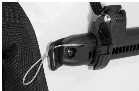
Anti-theft device mounted inside QL2.1 rail