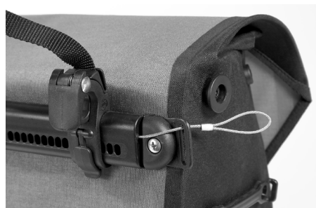
Anti-theft device mounted to QL2 pannier