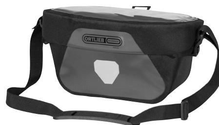
Image: 5 L version