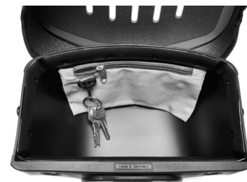
Internal pocket and key hook